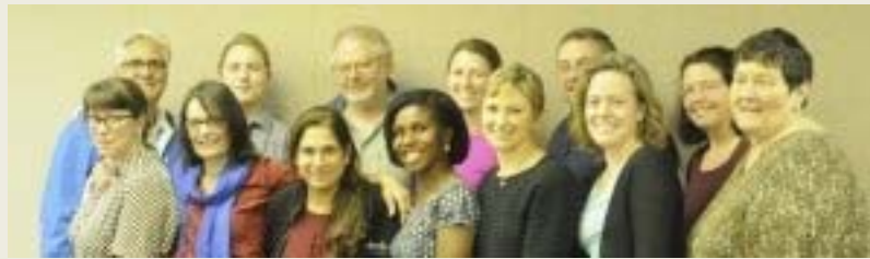
2014-15 Clinicians' Network Steering Committee