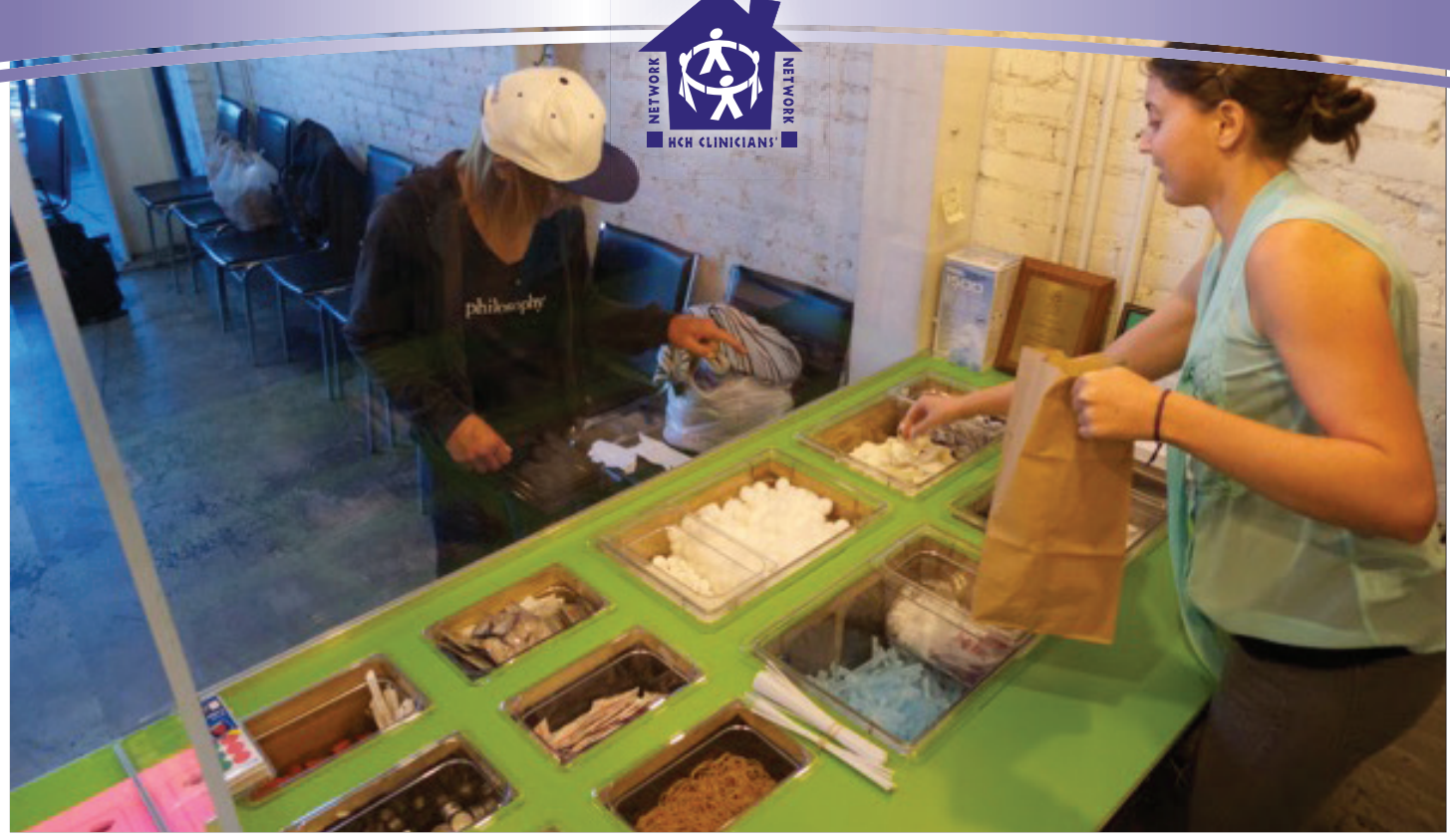
Clients access safe, clean injection supplies at the Center for Harm Reduction in Los Angeles, California.