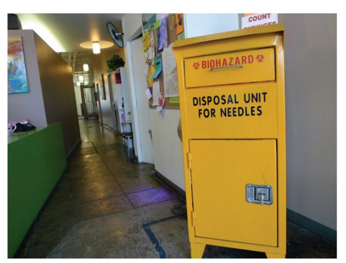
Needle disposal unit at the Center for Harm Reduction in Los Angeles.

We keep our clients safe by distributing clean injection supplies, providing disease management, and offering education that focuses on overdose prevention/reversal with naloxone and safer injecting techniques.