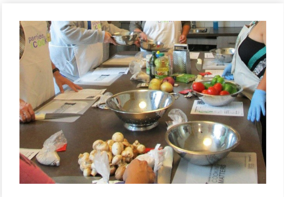
A "COOKING MATTERS" CLASS AT CENTRAL CITY CONCERN'S OLD TOWN CLINIC IN PORTLAND, OREGON

Our offerings include acupuncture, art therapy, positive thinking, healthy cooking, and a wellness calendar. Every day of the week there are several activities available that provide comprehensive spirituality, healing, qi gong, yoga, and clay and ceramics. We also have a new collaboration with Oregon Food Bank: Cooking Matters, a 6-week cooking program for clients who may not know how to cook or know what is in season; they get... a better understanding of nutrition and cooking on a budget... I would consider these programs preventive care. Most people just think of medical visits and checkups and things like that, but primary care is also about engaging people