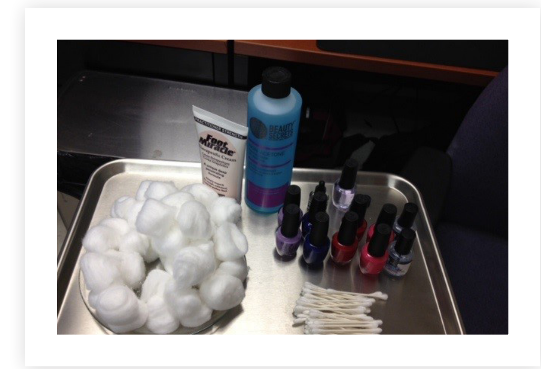
Supplies arranged in Preparation for a foot clinic "Spa Day"

A Publication of the HCH Clinicians' Network