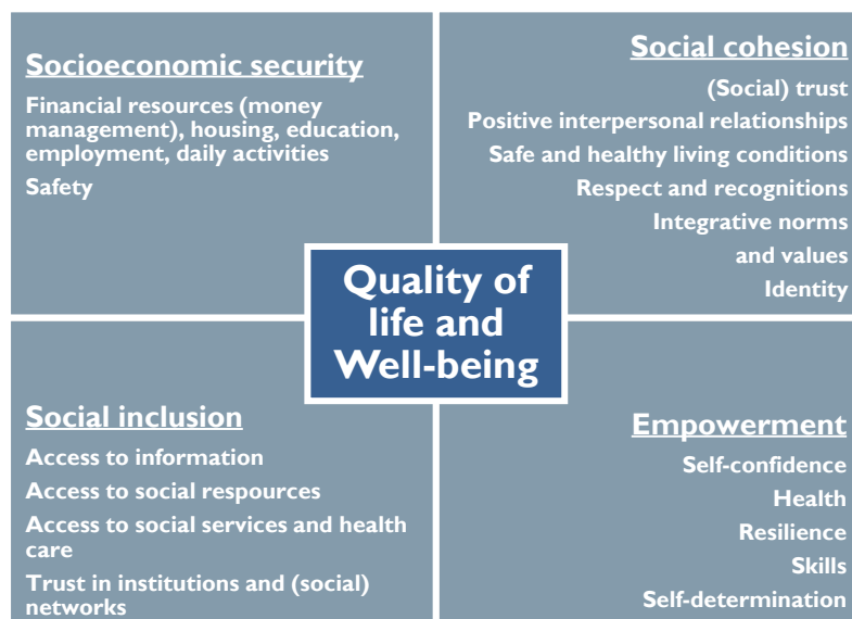
Figure 2: Conditional factors for quality of life and well-being among homeless youth (adopted from Altena et al. 2010)

Recent reviews of a wide range of homeless youth interventions (e.g. STI, vocational training, and behavioral health interventions) have revealed that they are generally ineffective due to a narrow focus on