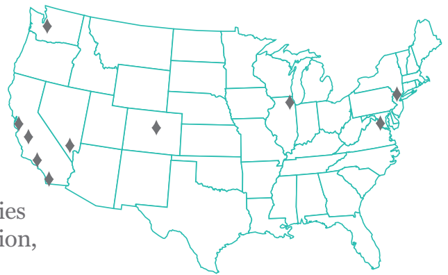
FIGURE 2: DISTRIBUTION OF ESSENTIAL HOSPITALS AND HOMELESS SERVICES ACROSS THE CITIES WITH THE 10 LARGEST HOMELESS POPULATIONS 26

In the top 10 U.S. cities by homeless population,